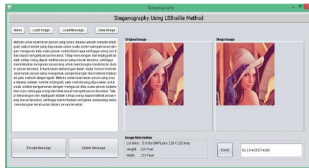
FIGURE 3. Testing PSNR

pada piksel yang menampung pesan, maka pesan masih bisa diekstrak kembali.