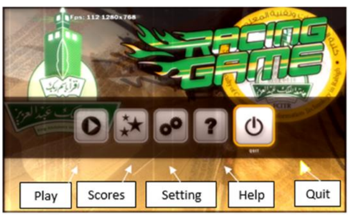
FIGURE 2. Main Interface of Racing Game

The racing game that used for the post stroke rehabilitation has several features such as main interface that consist of several button for interaction. Figure 2 shows the main interface that have four menus: Play, High Scores, Setting, Help and Quit.