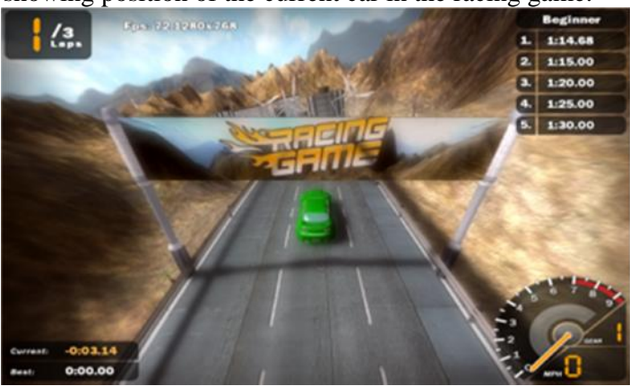
FIGURE 3. The Starting of Racing Game

After car selection, user may choose track as shown in Figure 3, whether they want use beginner, expert or even advanced track. These tracks shows the level of difficulty of game. The more advanced game, the track will have more curve for turn and more obstacle on the track. In order to do menu selection user only need to wave their hand and the cursor will move according to the hand. Some information such as lap (1/3 laps), FPS (Frame per Second). On left bottom the RPM (rotation per minute) and speedometer also presented to give an information regarding speed. The timer is showing position of the current car in the racing game.